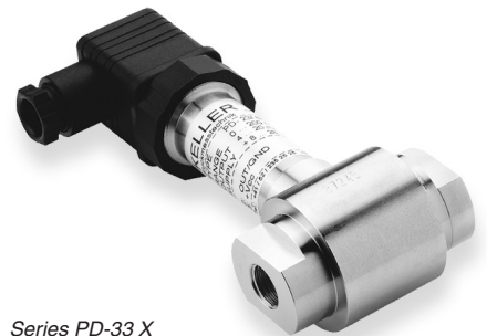
Series PD-33 X