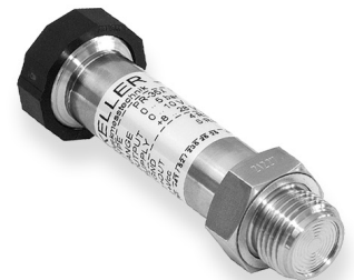
Series 35 X G1/2", flush diaphragm