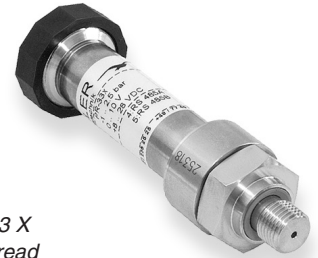
Series 33 X G1/4" thread

The transmitter's full-scale output can be set up to match any standard of your choice by correcting the gain with the PROG30 software.