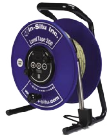
Level TAPE 200