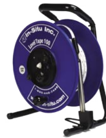
Level TAPE 100