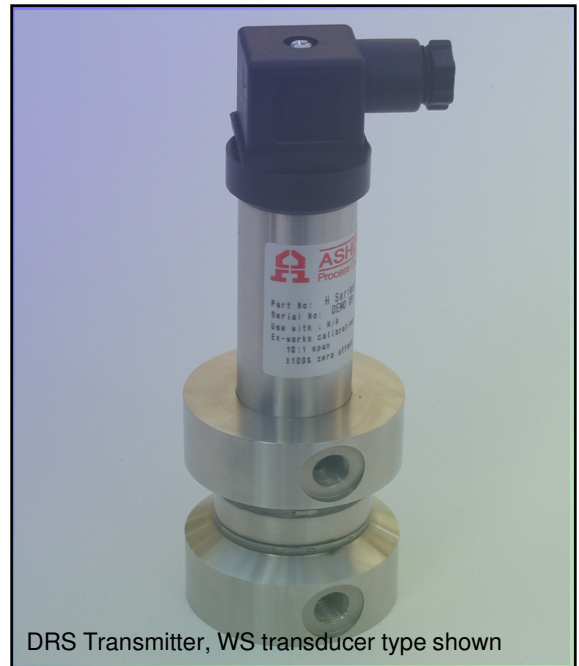
DRS Transmitter, WS transducer type shown

All transmitter types may have customer specified digitally set filter response times and filter jump out. The jump out feature disables the filter for step changes in the input pressure, this allows a faster response to large changes but provides a filtered response for variations smaller than the jump out value. Time constants from zero to 16 seconds and jump out values from 1% to 100% of FS may be specified. The factory configured optional response time settings can be enabled retrospectively by returning the transmitter to our works or an authorised agent.