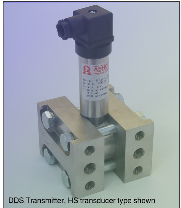
DDS Transmitter, HS transducer type shown

All factory enabled options can be enabled retrospectively by a return to our works or an authorised agent.