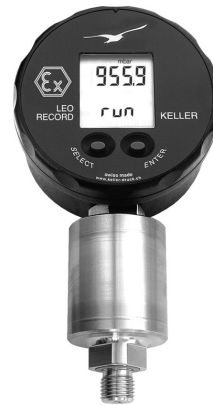
LEO Record Capo Ei